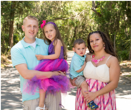
The Weber Family

The Star-Spangled Babies showers provide these new and expectant parents with early childhood education tips and a support system when loved ones are far away.